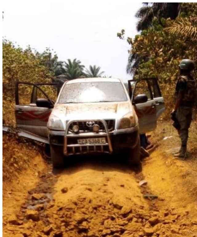
Ekondo Titi D.O ambushed and killed by the separatists