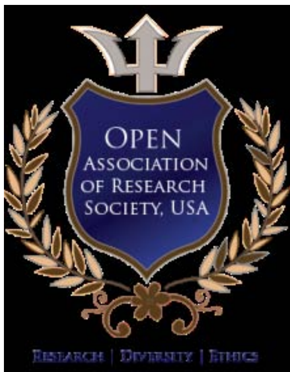
Figure 1: by

It was observed that there was a significant improvement in the cardio-vascular endurance of the experimental group through the circuit training programme. It was also found that there was no significant improvement in cardio-vascular endurance of the control group which did not have the circuit training programme. Within the limitations of the study and from the findings of the analysis of the data, Circuit training may be considered as a vital part of the physical education programme in all schools, to improve the Cardio vascular efficiency of the students. Circuit training exercises to suit the need of the athletes may be framed for all athletic events. Circuit training may be used more often as a conditioning device. This study may be conducted in a more elaborate and extensive manner to cover different age groups. This training method may be compared with other training methods. Circuit training needs specialized research studies relating to its contribution to speed, co-ordination agility, flexibility etceteras.. 1 2