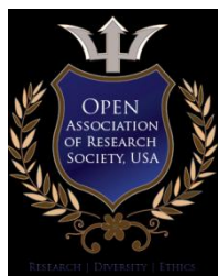
Figure 1: C