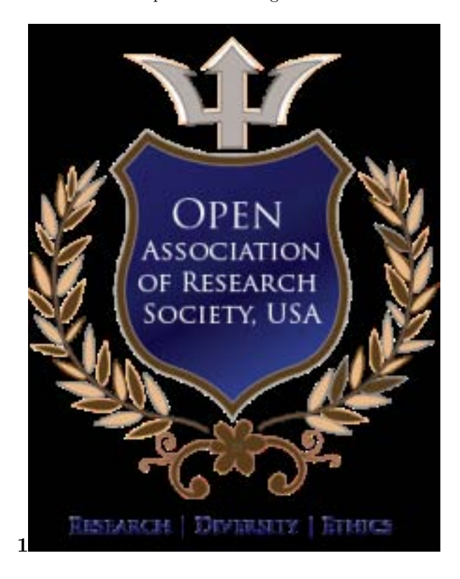
Figure 1: Figure 1:

remain over crowded, beyond their carrying capacities which is a great threat to the fragile ecological setup of the region. Therefore, there is an urgent need to regulate the tourist flow across the different tourist regions and different seasons of the year through proper marketing, infrastructure development and better accessibility. This in turn will help in minimizing the adverse environmental impacts, maximizing the economic gains and over all sustainable development of the region.