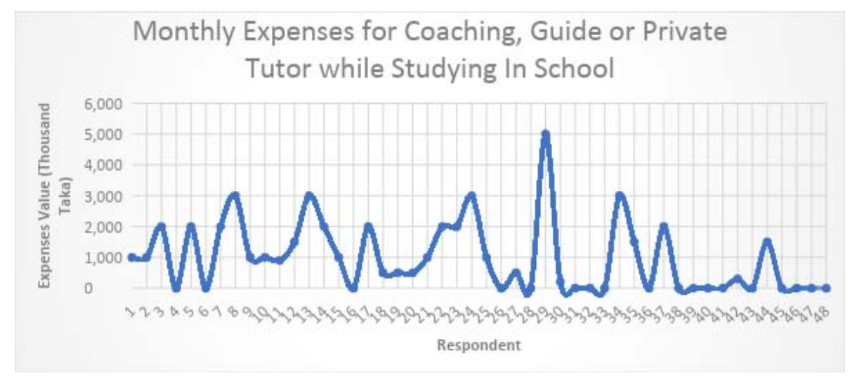
Figure 2: Monthly educational expenses of the respondents.

average expenditure on education of the sample is 3043 BDT per month and additional expenditure for buying stuff like pen, pencil, books and coaching etc. was 998 BDT per month. The following graph exhibits the additional expenditure in a better manner.