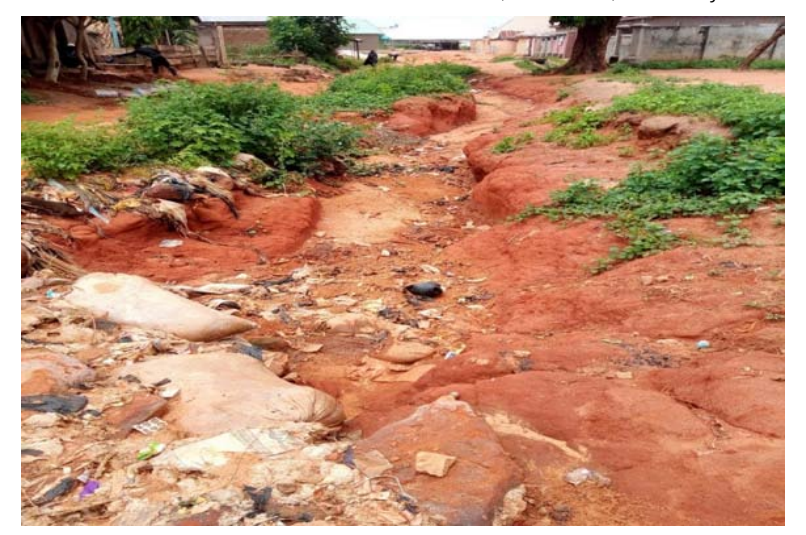
Plate 5: A typical gully site in Danka, Lafia LGA

at this gully site were; sand 86.2%, silt 4.4% and clay 9.4%. In Gundu site, the medium gully recorded had particle size distribution of clay 9.4%, silt 3.4% and sand 87.2%, covering an area of 676.5m<sup>2</sup>, with a depth of 7m and a width of 5.5m, while the length of the gully was 123m. This site recorded particle size distribution of; clay 9.4%, silt 3.4% and sand 87.2%. Similarly, the medium gully in Gimare site covered an area of 1016m<sup>2</sup>. In terms of length, width and depth, gullies recorded at this site had a length of 127m, width of 8m are were 6m deep. The particle size recorded at this site were sand; sand 88.2%, silt 5.4% and clay 8.4%. In Kwandere site, the medium size gully recorded had a length of 112m, covering an area of 784m<sup>2</sup>, with a width of 7m and depth of 6.5m. The particle size distribution included; sand 91.2%, silt 3.4%, and clay 5.4%.