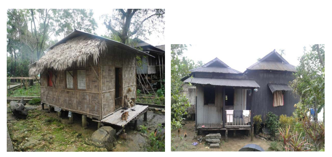
Plate 1: and Plate 2: Depict the changing house pattern of Khasi Tribes.

During Survey, it is found that the indigenous building techniques and house pattern of Khasi tribes which are directly connected with nature and climatic condition are now replaced by modern building pattern and techniques. It is said by a village council member that in his childhood days during summer monsoon, it rained at least once for nine days and nine nights without a break and he has an opinion that the change in rainfall affects the quality and quantity of crops. Orange is no longer sweet as it was. Meghalaya is a part of the Indo- Burma bio- diversity and most threatened hot spot areas in India due to climate change. It is the critical or endangered or vulnerable rain forest so the tribes, trees and wild animals who are the part of this ecosystem are also threatened. According to 2017 Indian Institute of Technology declared that the average temperature rose 0.031 degree C every year over 32 years. This is very much significant for the