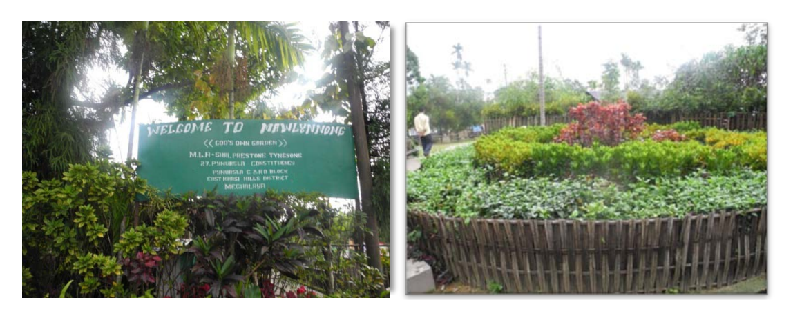
Plate 7 and Plate 8: Depicts the scenario of the cleanest village of Mowlinnong.