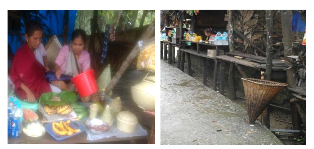
Plate 3: Khasi woen are busy to selling out of their foods in left hand side. Plate 4: Khasi women serve food in a tree leave in eco- friendly, handmade dustbin besides shop.

Living Root Bridge in Meghalaya is a simple suspension bridge, constructed trough rubber plant and by using ecological knowledge. At the age of modernization and Globalization, when people destroy forests to build cultural landscape and help to increase