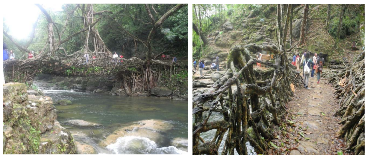
Plate 5 and 6: The Famous living root bridge in Meghalaya, denotes the ecological technique of khasi tribes.

the temperature of the earth, they produce greenhouse gases. The hanging root bridge is the symbol of traditional tribal Ecological knowledge, and it is necessary to imply these technologies more and more in development and constructional field.