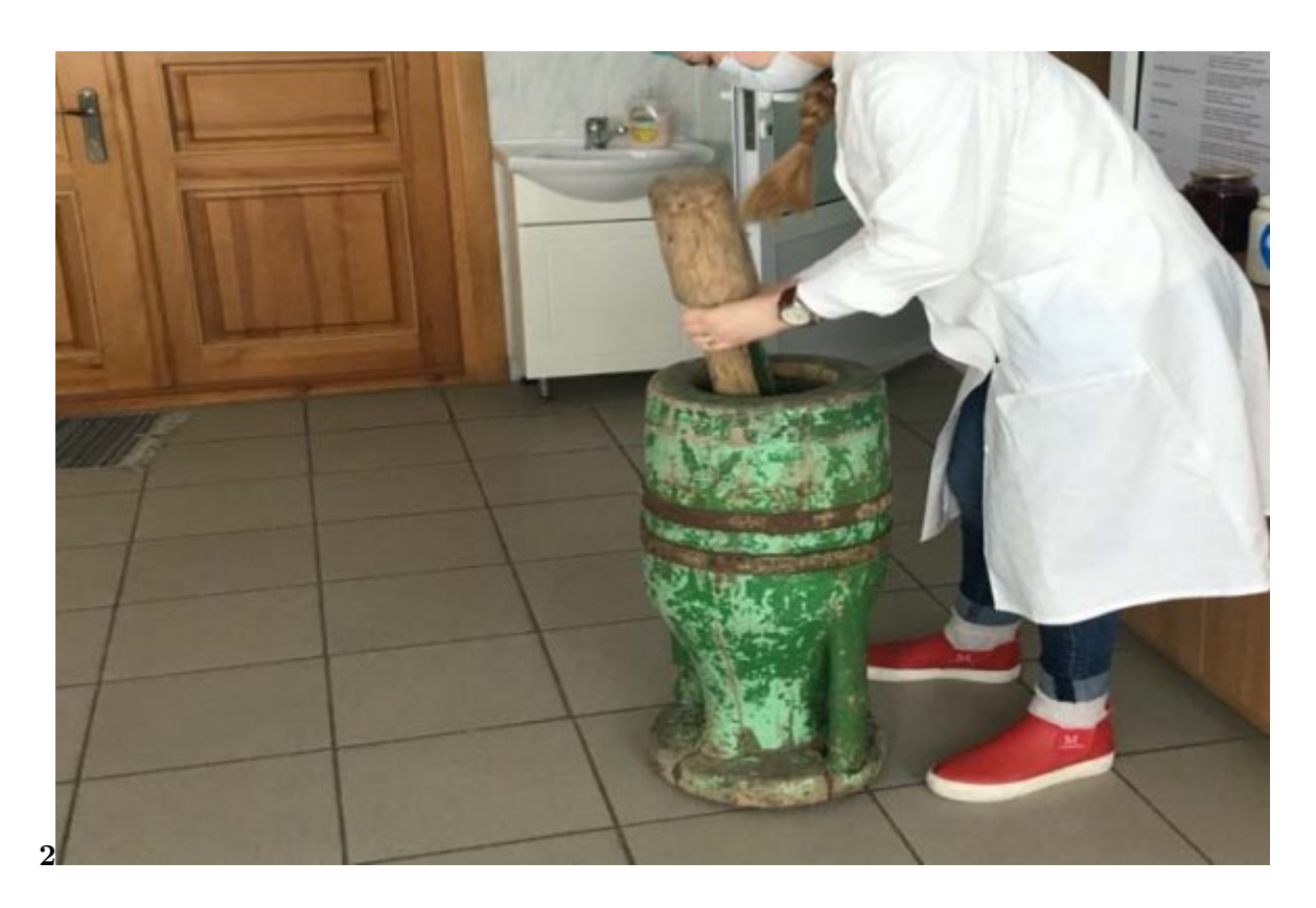
Figure 2: Figure 2: