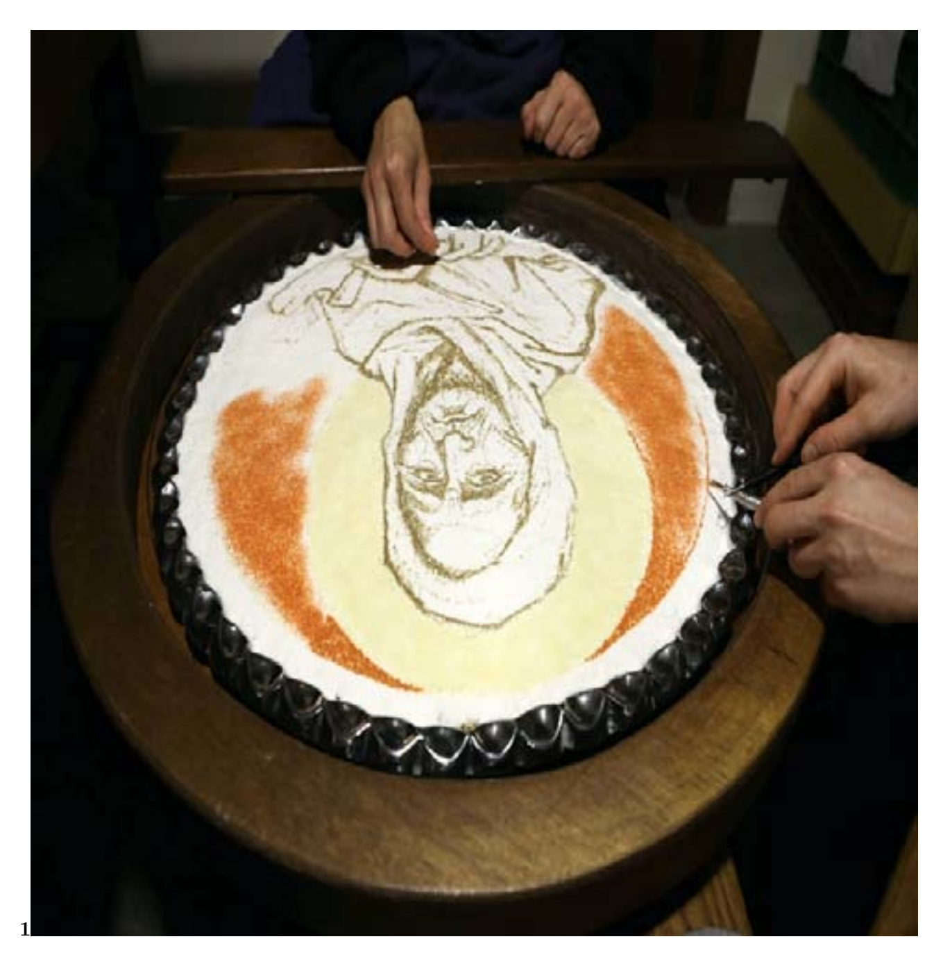
Figure 1: Figure 1: