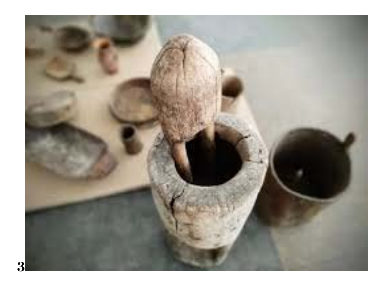
Figure 3: Figure 3: