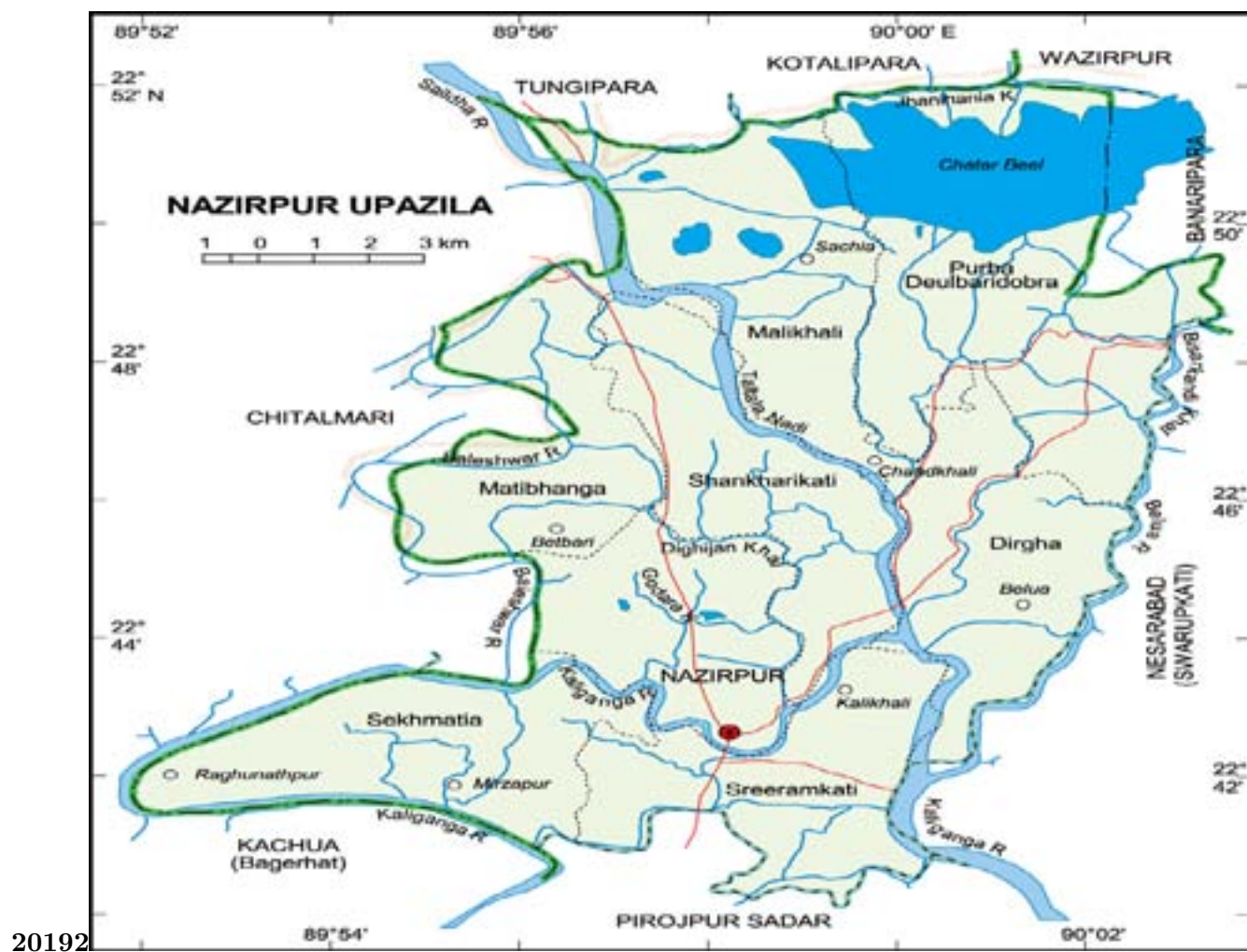
Figure 2: Fig. 2 :