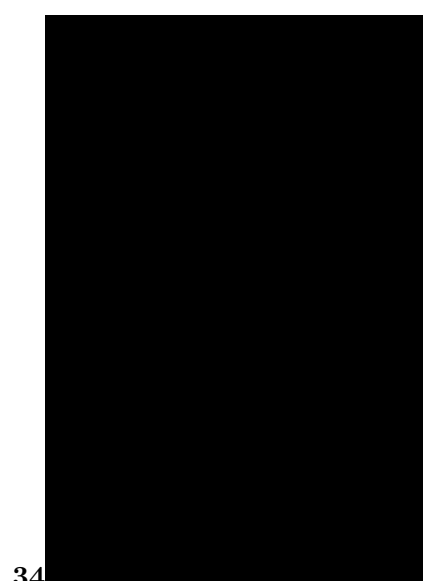
Figure 3: FloatingFig. 3 :Fig. 4 :