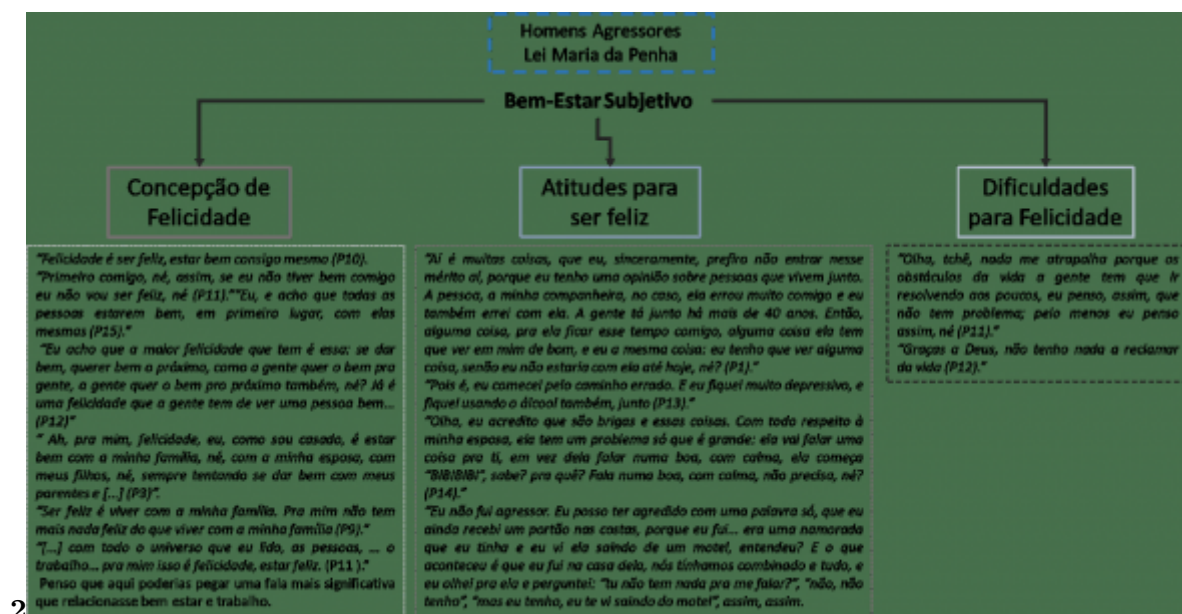
Figure 2: Figure 2