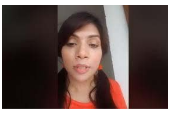
Nowshaba was on Facebook live.

Her 1.37 minutes long live video went viral on Facebook, which made many aware citizens confused authors whether it was true or not. Later she was arrested by RAB (Rapid Action Battalion) accused of spreading rumor (4 August 2018; bdnews24.com).