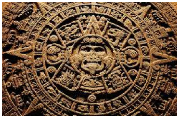
Figure 2: Nahui Ollin in the Aztec Calendar

can derive teachings applicable to meditation, fortunetelling, time scheduling, and medication. Each element determines a cardinal point, and surprisingly, its use and symbols correspond to those traced in the Aztec Calendar.