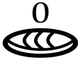
Figure 5: The Mayan Zero

The Mictlan formed a threshold of non-beings whose skeletons continued to be. The safeguarding of human remains is the origin of the cult of death that Mexicans continue to celebrate even today. It can be fascinating to see our dead as non-beings that continue to be, despite it may sound horrifying for the Western understanding. Before life crumbles and sinks into nothingness, it shapes and returns immutable, says Octavio Paz in The Labyrinth of Solitude . "We will no longer change but to disappear. Our death illuminates our life" (Paz, O., 1985, p.59).