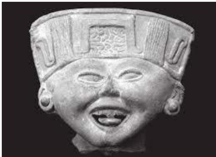
Figure 1: Totonac statuette with oriental eyes

It is beyond my reach to demonstrate that there were indeed historical contacts between the Chinese and the ancient Mexicans. However, it is verifiable that the pre-Hispanic cultures did elaborate thoughtful insights about the being and its existential becoming that keep equivalents with the schools of thought in Asia. In this essay my purpose is to highlight some metaphysical similarities between the Asian and Mesoamerican worlds. Possibly a former correspondent for The New York Times in Mexico was right when he expounded as a revelation that “[Mexico] has the only political system that must be understood in a pre-Hispanic context; and its inhabitants alone are still more Oriental than Western.” (Riding, 1984)