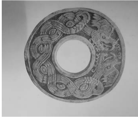
Figure 3: Quetzalcoatl as two opposites that converge

among the Mayans, Toltecs, and Nahuas; if not, how else could we interpret the poetry of the enlightened king Nezahualcoyotl?