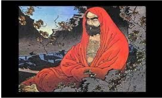
Figure 6: Da Mo or Daruma

In the year 607, corresponding to the heyday of Teotihuacan, the Japanese prince Shōtoku, renowned as wise and visionary, dispatched a special mission to China to bring back the most outstanding teachings of the culture; thus, Chan Buddhism came into Japan. By mixing with the local Shintō beliefs –especially with the aesthetic values of Shintō– Japanese Zen was shaped; more than a religious cult, Zen Buddhism became a way of daily living for all Japanese people.