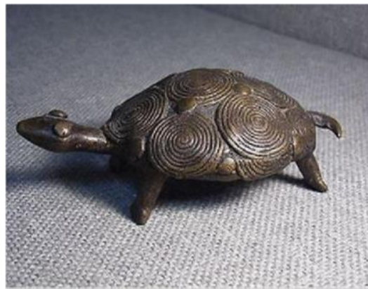
Figure 9: Akan gold-weight, Tortoise "Akyekyede". Image size: 500 × 304