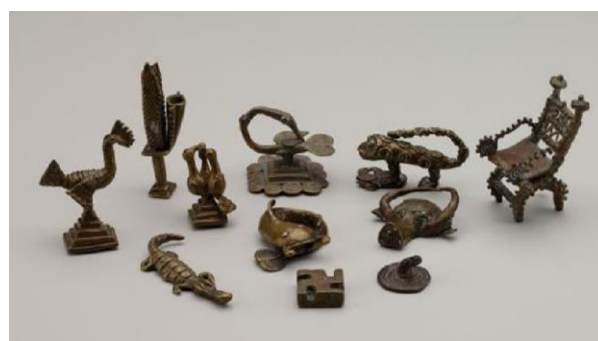
Figure 2: A sample of Akan Gold-weights, "Mmramuo", 1954. Image size: 2048 × 1477. Baltimore Museum of Art

Gold dust was then the currency used by the Akans until it was replaced with cowries, " sede3 " and later money in paper and coins in the nineteenth century. All weights can be divided into two broad categories which are: natural and not cast in metal like seeds, stones, bones which were used early on and those produced using the lost wax method whereby the molten metal poured into a mould created using a wax