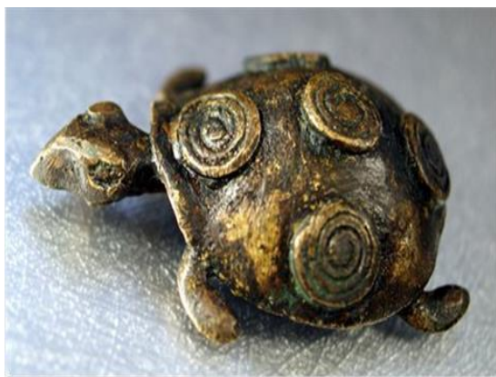
Figure 8: Akan gold-weight, Tortoise "Akyekyede". Image size: 159 × 244

tortoise symbolized preparedness, since it never knows when it will die, so it carries its shell along wherever it goes as an icon of coffins on its back as a reminder that irrespective of whom anyone is death is inevitable.