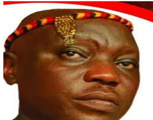
Figure 15: Akan gold-weight used as “abɔsodeɜ” by chiefs.

whereas the quite larger ones, at times, drowned with decorative textiles like kente fabric are used as decorative pieces both at homes and offices. The gold-weights are used as “abɔsodeɜ” of various shapes with different meanings which is worn by chiefs