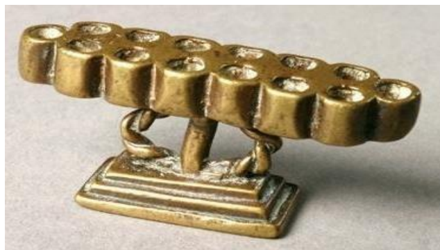
Figure 7: Akan gold-weight, "Oware"

Gold-weights which bore symbols of animal motifs reflected similar connotations as leopardlike figures with serpentine bodies symbolized character as according to common Akan folklore; "the leopard never loses its spots even in the rain". Similarly, the motif of a