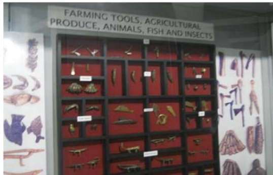
Figure 12: Akan gold-weights exhibited to depict farm tools of Akans (their way of life), 2016. Institute of African Studies, University of Ghana, Legon.

The aesthetic nature of the gold-weights, now perceived as art, makes people buy them from the open market as well as museums and art centres. The varied sizes now produced range from very small ones which are used as bead pendants ends for traditionally designed neck wears, key holders and hair accessories