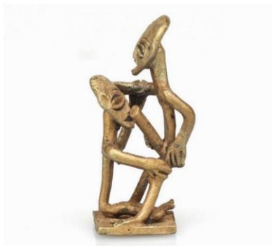
Figure 16: Akan erotic gold-weight for sale online. Private Collection. F.d.G in NL/Tribal Art Treasures

The gold-weights also at times portrayed the reproductive lives of the Akans. The erotic illustrations perhaps were given to newly married couples and also could be a symbolic representation of the hazards of