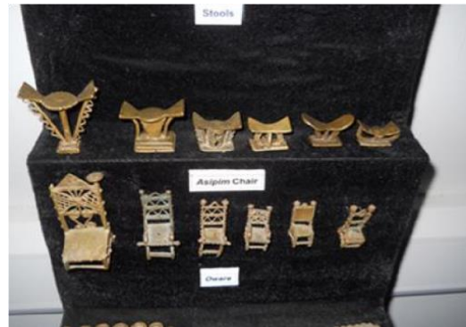
Figure 13: Akan gold-weights exhibited to depict the badge of office of their respective chiefs (their way of life), 2016. Institute of African Studies, University of Ghana, Legon.

whereas the quite larger ones, at times, drowned with decorative textiles like kente fabric are used as decorative pieces both at homes and offices. The gold-weights are used as “abɔsodeɜ” of various shapes with different meanings which is worn by chiefs