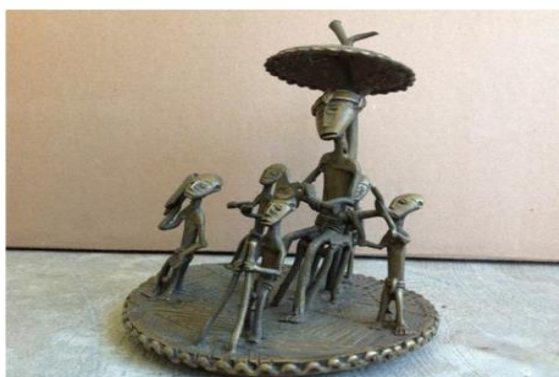
Figure 10: Akan Gold Weight depicting their daily life. Image size: 736 × 549