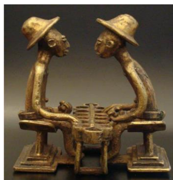
Figure 6: Akan gold-weight, Two people playing "oware"

known stories notably executed to be passed down to other Akan generations. Each gold-weight told a story, riddle or gave codes of conducts that helped guide the way Akans lived. "Oware", a common Akan indoor brain game normally played by elders is portrayed with gold-weight as it also symbolized the Akan badge of office in chieftaincy- the stool; hence, the bottom looking like the stool. The "oware" as well as the one with two people playing also symbolizes an event that happened at Fehiase. Ntim Gyakari, the then chief went to Fehiase to play "oware" in public and disaster fell while playing the game. That is the import of the saying "Ntim asoa ne dɔm ako ɔɔ ne man ɔɔ Fehiase, meaning Ntim destroyed his township at Fehiase in English. It tells how keen we should be in our term of authority and to be much conscious of how best to preserve what we have.