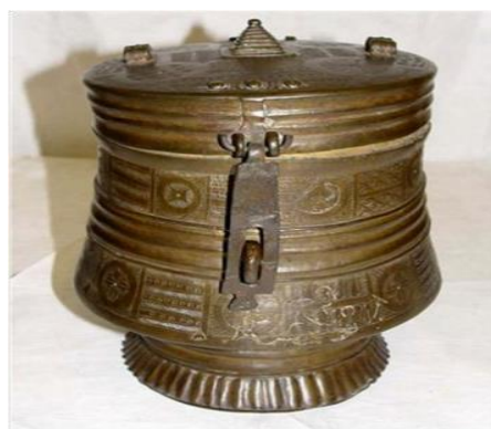
Figure 5: A cast brass container use for storing gold-dust, "kuduo"

owned a collection of more than a hundred weights- the number of weights owned by an Akan determined how worthy and respected the person was as that determined how much purchases and commerce a person could be of. The Paramount Chief, "Asantehene" and other chiefs had weights cast in gold, while the Queen Mother, "Ohemaa" occasionally had sets made of silver (Payne, 2015). According to Fiona Sheales, Bowdich claimed although gold weights were mainly cast in brass, Asantehene Osei Bonsu's scales, blow pans, boxes and weights were made of the purest gold.