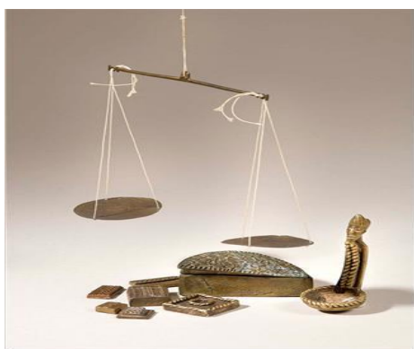
Figure 4: A scale, "Nsania", a decorative brass spoon, "famfa" and other Akan Gold-weights. Image size: 544 × 613

commerce and are believed to predate the figurative form. The figurative forms of the Akan gold-weights emerged in 1800 with the establishment of the Asante kingdom in 1750 AD when the Asante's used artisans from Denkyira to do the casting. These artisans in doing their work created works that depicted their stories and their past (Owusu, 2016) and also their moral values; hence the synonym "Proverb Weights" (Payne, 2015). Gold-weights were status symbols often gifted to men of office, such as priests, soldiers and diplomats, as well as to newly married men. A wealthy man may have