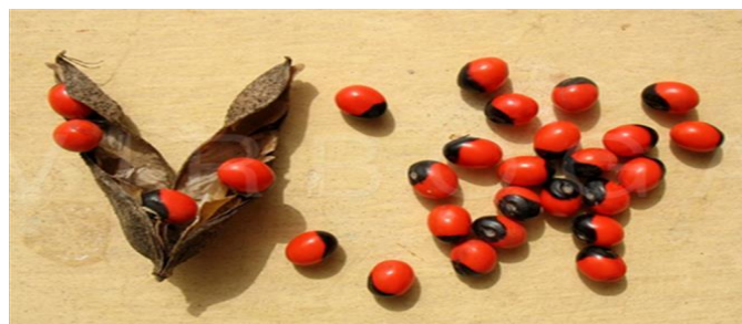
Figure 3: Abrus precatorius seeds, "Damma"

model is heated to melt the wax and the product (metal gold-weight) is retrieved. The seeds represented the smallest units of Akan gold-weights and measures which included " powa " and " kokwa " among others (Payne, 2015). A tiny, hard, red and black spotted seed, locally called " damma " of Abrus precatorius , a tree commonly found in the tropics were used long before the gold weights were cast in metal.