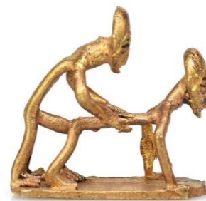
Figure 17: Akan erotic gold-weight for sale online. Private Collection. F.d.G in NL/Tribal Art

Wars and as such to prevent them as women were brutally raped by some of the soldiers. The private collection of Tribal Art Treasures consists of some of the erotic Akan gold-weights being sold online.