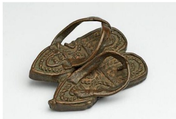
Figure 11: Akan Gold Weight, Traditional sandals Image size: 544 × 350