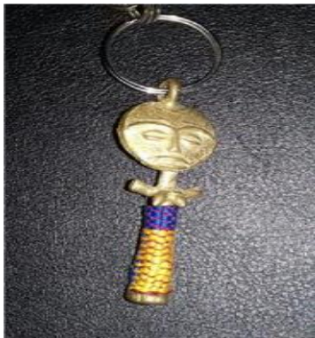
Figure 14: Akan gold-weight used as a keyholder.

The aesthetic nature of the gold-weights, now perceived as art, makes people buy them from the open market as well as museums and art centres. The varied sizes now produced range from very small ones which are used as bead pendants ends for traditionally designed neck wears, key holders and hair accessories