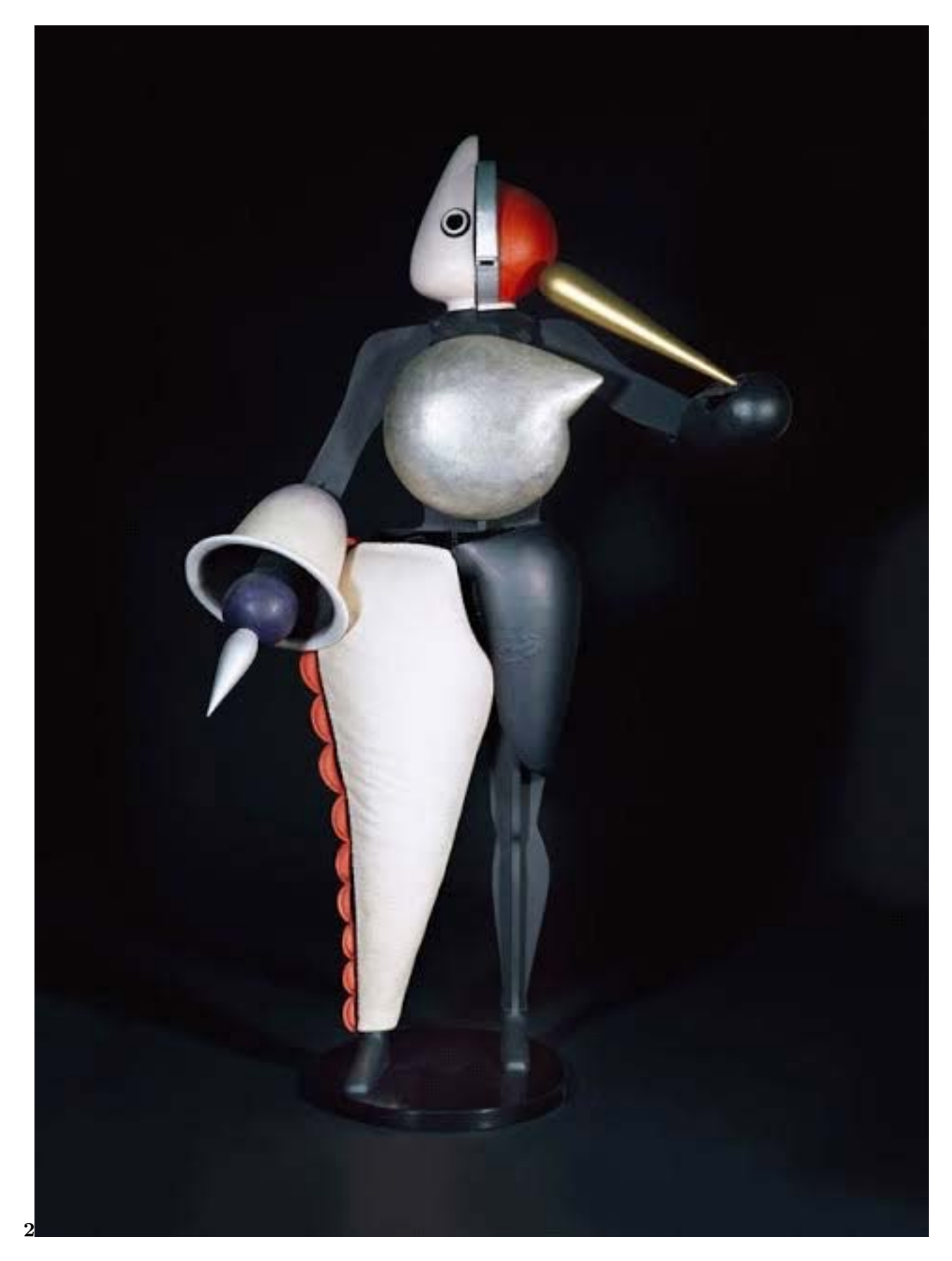
Figure 1: Figures 1 and 2 :