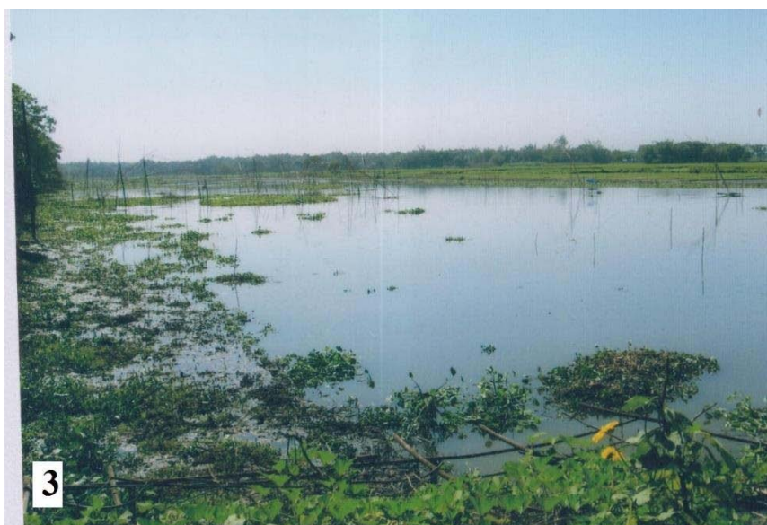
Fig. 3: Distribution of mixed population of macrophytes in Bansdahabeel.