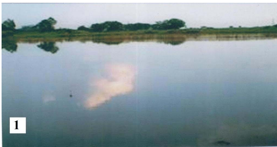
Fig. 1: Picture of the experimental site, Bansdahabeel.