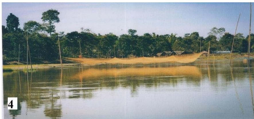
Fig. 4: Figure showing the main culture and collection zone for various type of fish species.