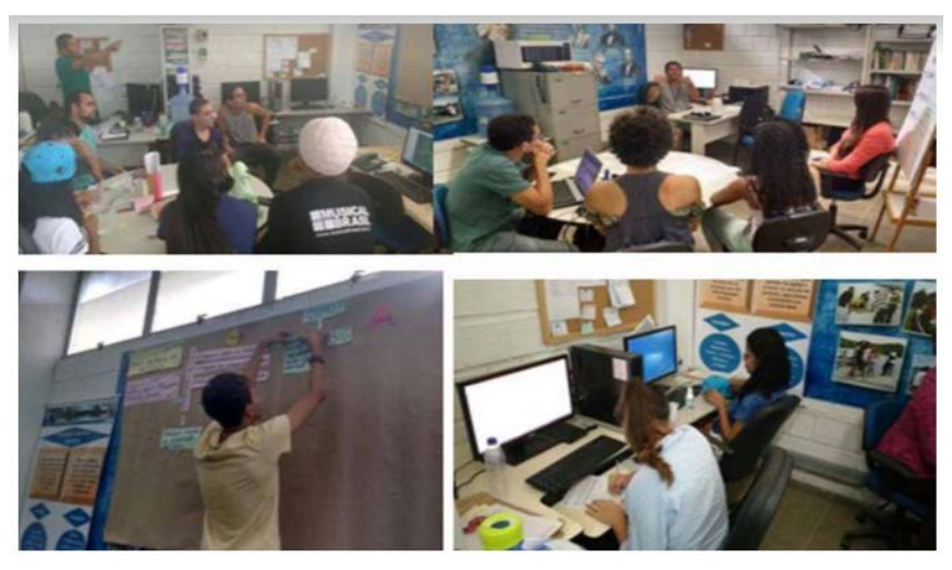
Figure 1: EPEC students being trained to work in the design and execution of socioeconomic projects

interaction, the students first undergo a training process to understand the dynamics of the communities and also how they should proceed (Figure 1).