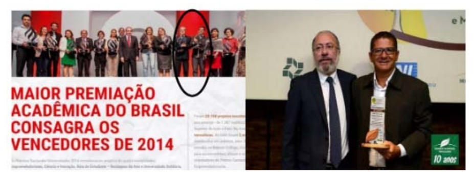
Figure 5: Receipt of the Santander University Solidarity Award in October 2014 in São Paulo (a) and the Brazilian Forest Service Award in Brasília, March 2016 (b).

Solidarity Award 2014 and the III Brazilian Forest Service Award in Economics and Forestry Market Studies (Figure 5), both resulting from the research and extension of the EPEC.