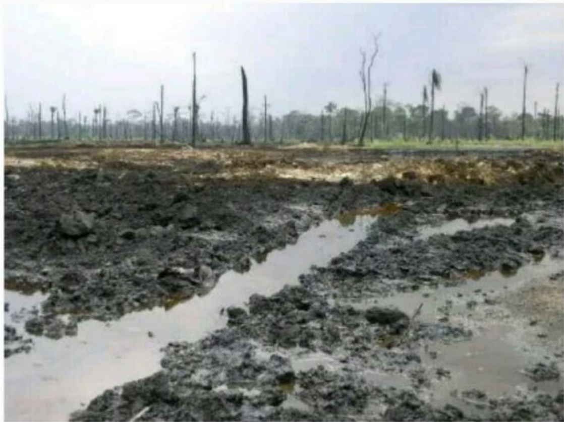
Figure 2: Figure 2 . 2 :