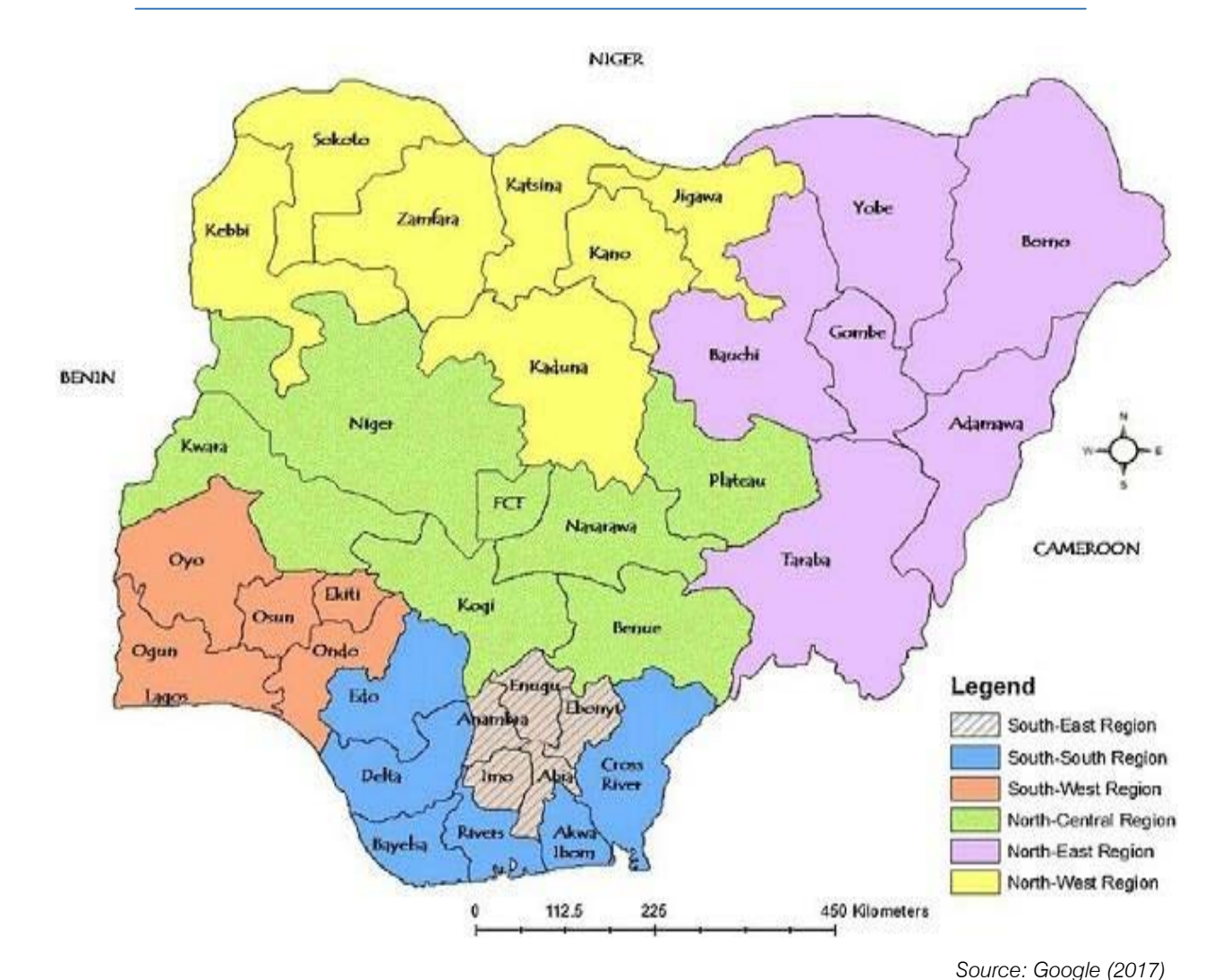
Figure 1: Geo-political Zones of Nigeria

Farmers have their crops to protect and Herdsmen their livestock to protect. This simply implies that value of land for both crop and animal production is increasing across Nigeria. But then, Herdsmen have been present to varying degree in all the thirty-six states across the six geo-political zones of Nigeria including Abuja the nation's Federal Capital Territory. And in all these regions, conflict between them and farmers have been reported on several and different occasions. But the occurrence of such confrontation in the north central region of the country surpassed that of the other regions of Nigeria put together. The pressure on land is increasing the movement of herdsmen from the Sahel region of the country to the vast grassland in the central area of the country. This increase in movement is often accompanied with pressure on available land in the central region of the country. The scale of deaths incurred have always created tensions on how a seemingly previously contained conflict could lead to massacres that today stands as one of the major threats to national security, peace and unity in Nigeria. Investigating alternative measures that can be adopted