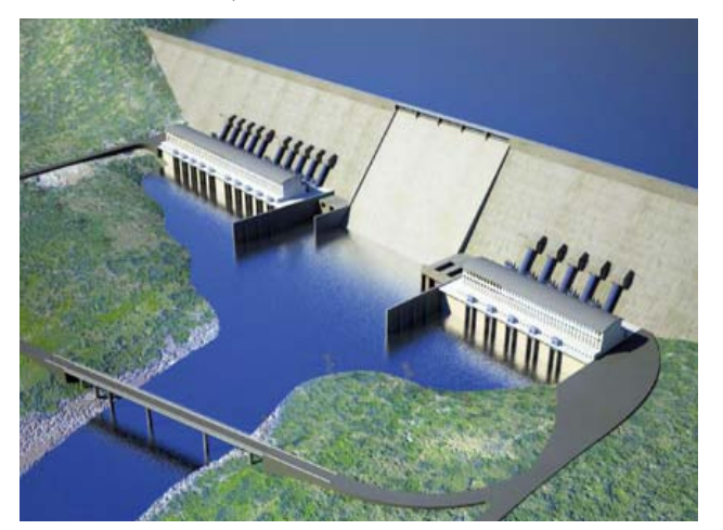
Figure 1: Rendition of the Grand Ethiopian Renaissance Dam (GERD)

the then Prime Minister (Mr. Meles Zenawi) of Ethiopia. The project is owned by the Ethiopian Electric Power Corporation (EEPCO). The planning phase of the project was carried out under the name called Project X, which was later changed to Millennium Dam and finally to the present name (Grand Renaissance Dam, or just Renaissance Dam).