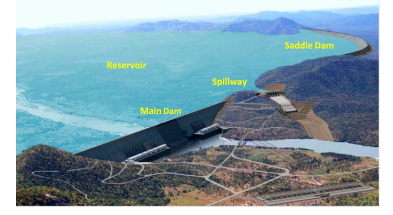
Figure 4: Main Dam and Saddle Dam of GERD

water to the Nile River. Sewilam asserted that some Egyptian researchers are currently working in different concentrations, such as water treatment, water recycling, increased irrigation efficiency, and desalination. El-Baradei also said (HornAffairs, 2016) that the Government of Egypt needs to consider using groundwater wells as a water resource, but only after treating the saltwater. Sewilam, however, believes that the solution ultimately lies in greater cooperation between the Nile Basin's countries to secure water and other natural resources (HornAffairs, 2016). "There should be an integrated Water-Energy-Food Nexus plan for all the Nile Basin countries. We should be thinking of self-sufficiency of resources by complementing each other, as for example, we need to identify the countries in the Basin which can generate energy and other countries which can supply water and also the countries that can make use of water and energy to produce enough food for the whole basin" (HornAffairs, 2016). "/ think the lack of trust, cooperation, and participatory long-term planning between all the Nile Basin's countries are the main reasons for the current situation" (HornAffairs, 2016). "The main Dam is allocated for generating electricity while the side Dam is just for water reserves and it won't affect the power generation process of Ethiopia if the amount of the reserved water is reduced" (HornAffairs, 2016). The GERD's both main and saddle dams are shown in Figure 4.