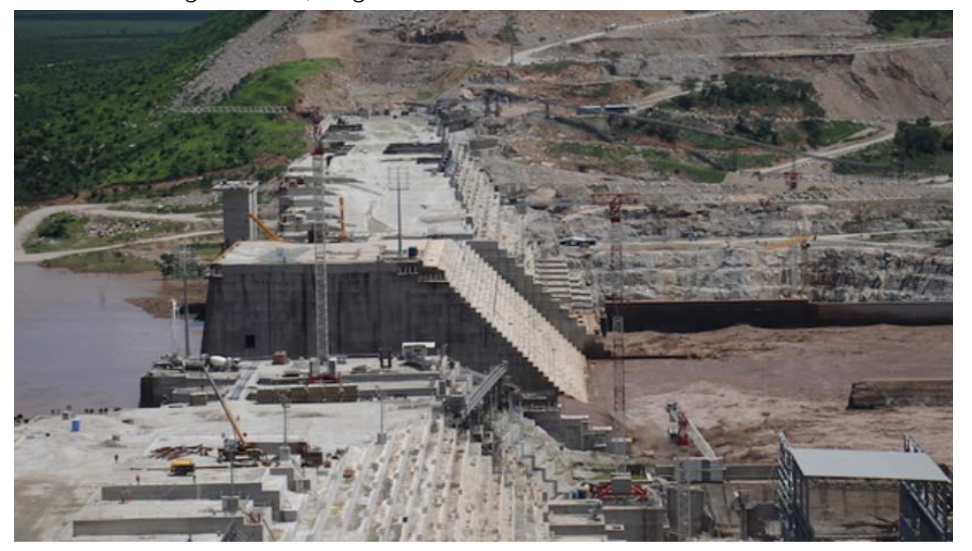
Figure 3: Overview of GERD on July 31, 2016

III, and Tana Beles. It is estimated that the project will consume 10 Million metric tons of concrete to be produced locally. Diversion of the Blue Nile River was completed on 28 May 2013. Nearly 32% of the project was completed in April 2013 (Mariam, 2015). The contract for supply of low- and high-voltage cables for the Dam was awarded to the Italian firm - Tratos Cavi SPA - in March 2012 by Salini Costruttori. Alstom (a French multinational company) has provided the eight 375 MW Francis turbines for the first phase of the project at a cost of €250 Million (approximately US$ 264 Million). Over 9,000 workers (including 400 foreigners) have been working on the construction of the Dam. An overview of the Dam on July 31, 2016 is shown in Figure 3.