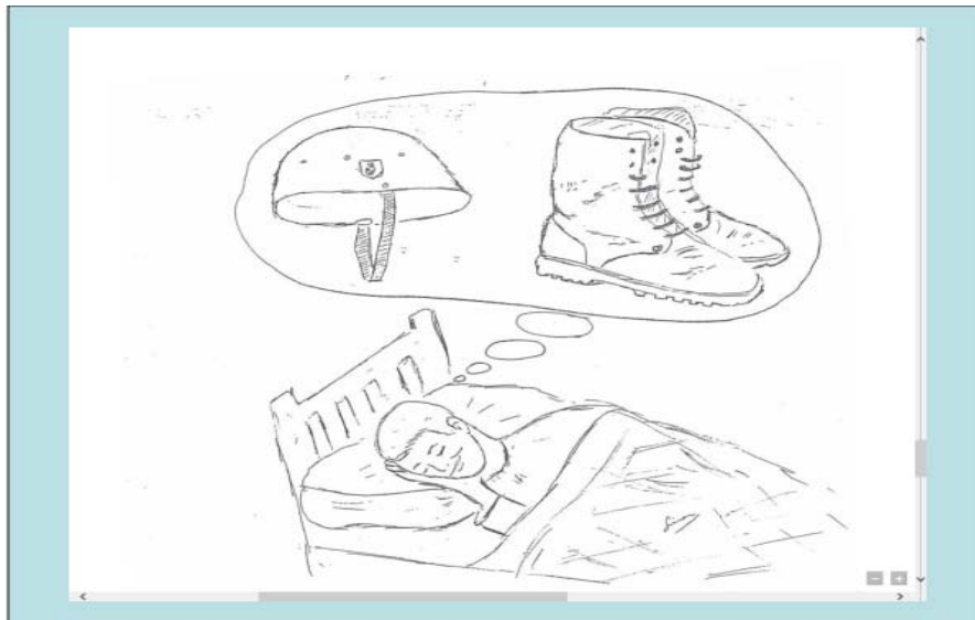
Fig.5: Many Turkish youths look forward to the military service, despite expected hardships (illustration by the Author).