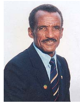
Fig. 3: Champion Wolde (internet)