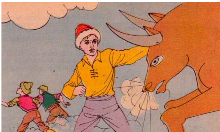
Fig. 1: Bogach Khan against the Bull.

The tradition stipulates that a great task be executed to earn a name. In the festivities of another lord, Bayindir Khan , the boy engages in a fight with a fierce bull ( boğa in Turkish) (1) and beats it with a mighty fist-blow. The notables of the tribe then bestow him with the glorious name Bogach Khan.