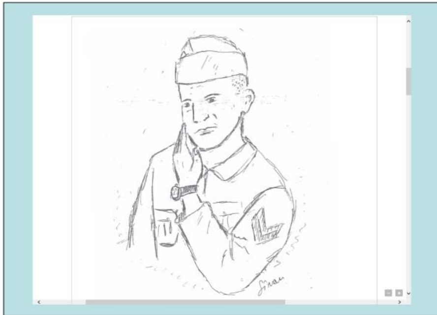
Fig. 7: Earning double stripes on the arm is a further sweet initiation for some. A proud photograph is immediately sent home. In villages, this rank becomes a life-long nickname (illustration by the Author).