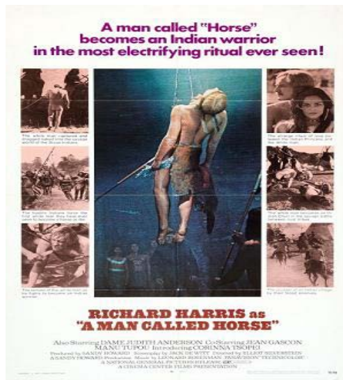
Fig. 2: The above-mentioned movie's poster (internet).

(The defiant bard goes on: The High Edict of the Sultan is his own possession / While all this hilly landscape is our possessions ).