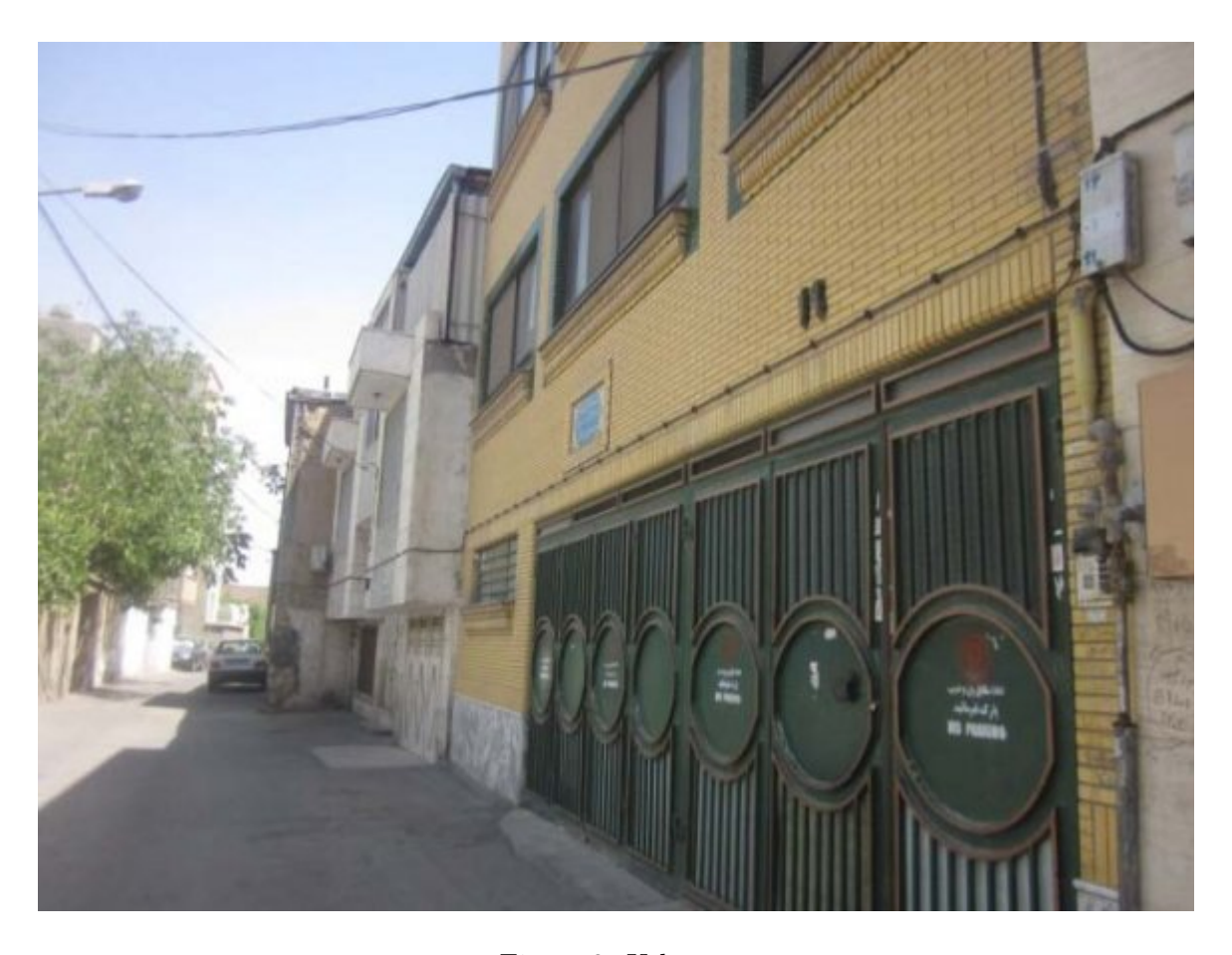
Figure 2: Urbanscape