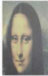
The result of looking from left at the central picture