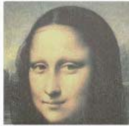
The central picture