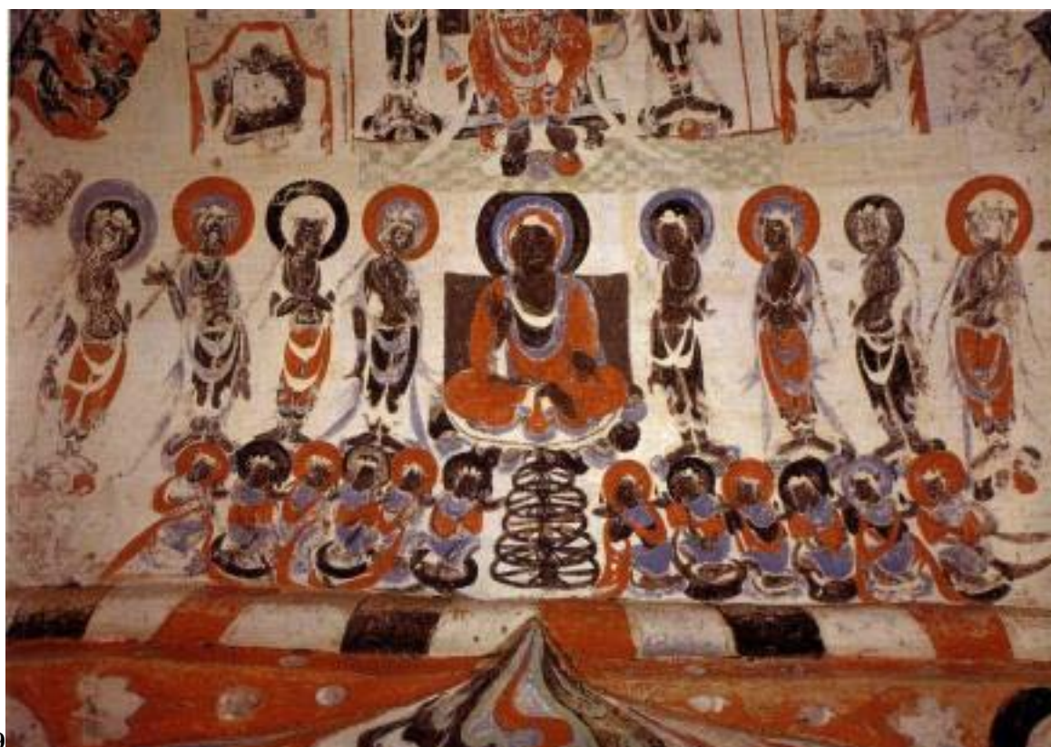
Figure 7: Figure 7 :