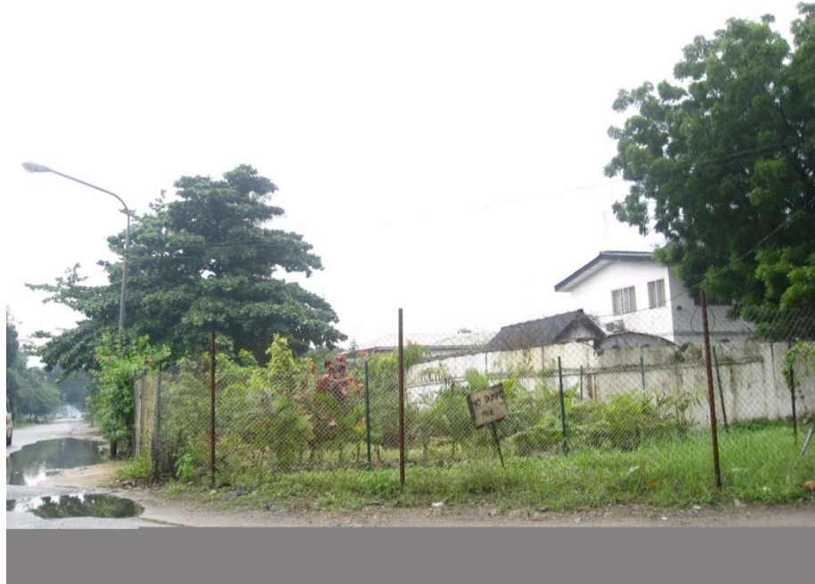
Figure 1 : A typical example of horticultural garden on road setback

The neglect of such areas by charlatan government often leads to their abuse by the public who use the spaces for selfish and less beneficial purposes to the built environment. The slogan goes that a 'no man's land' is of no 'man's concern'. What this implies is that most road side vacant lots along streets in African modern urban cities are being neglected by their governments, not planned, and abandoned by residents and therefore less beneficial to the community (Abegunde, 2008; Abegunde, Omisore, Oluodo and Olaleye, 2009).