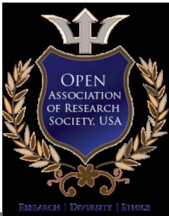
Figure 1: 3