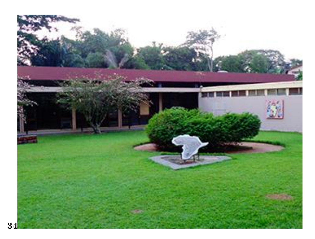
Figure 9: Figure 3 . 4 :