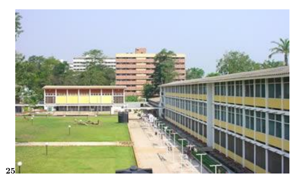
Figure 2: 25 Kwame