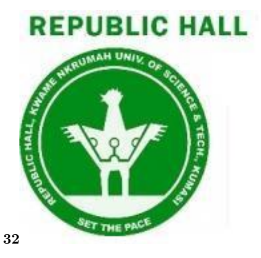
Figure 7: Figure 3 . 2 :