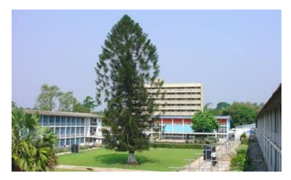
Figure 4: 51