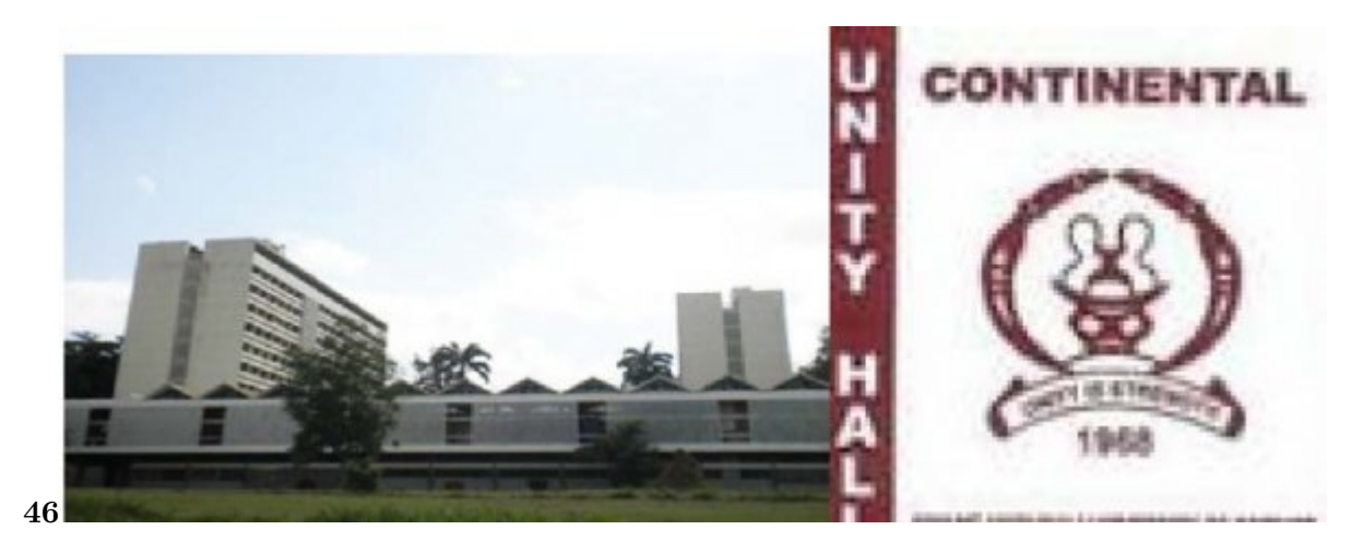
Figure 11: Figure 4 . 6 :