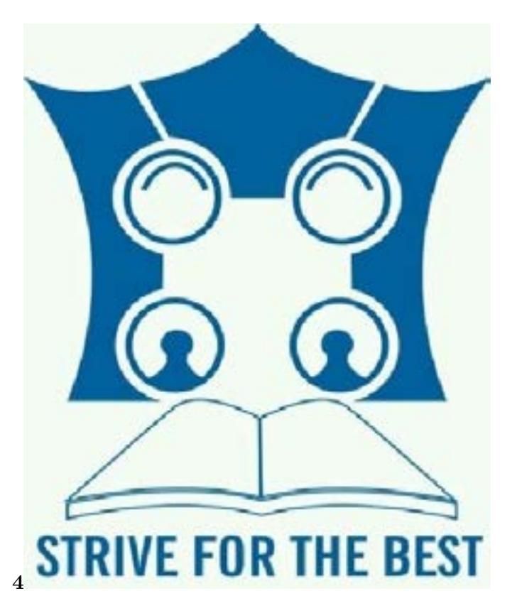
Figure 5: Figure 4 .