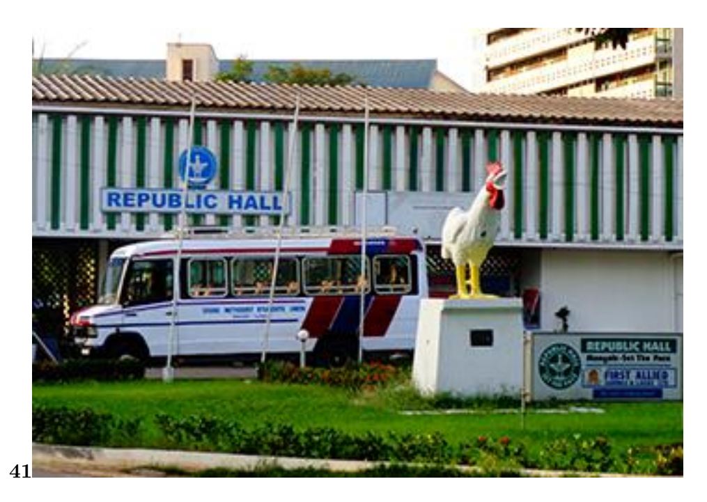
Figure 6: Figure 4 . 1 :