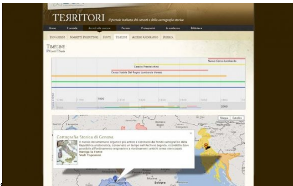
Figure 4: Figure 3 :