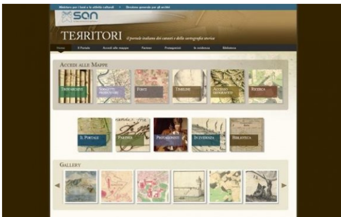
Figure 2: Figure