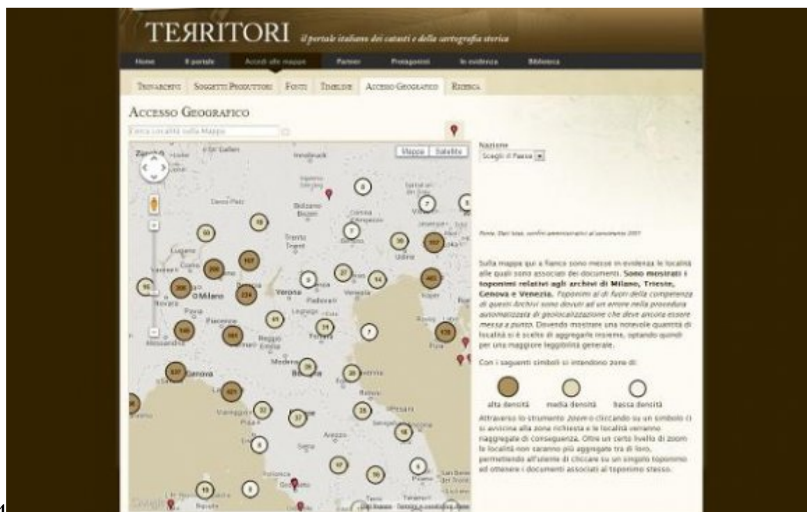
Figure 5: Figure 4 :