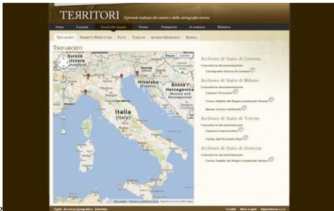
Figure 3: Figure 2 :