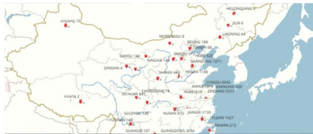
Fig. 3: Geographical distribution of poets in the past dynasties [4].