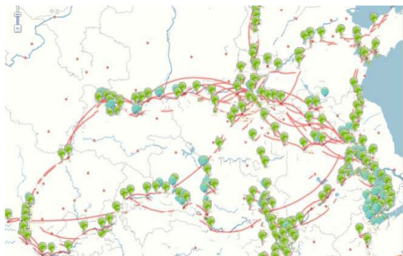
Fig. 1: Electronic map of Su Shi's movements (Chronological maps of Tang and Song literature[2])

At the forefront of literature research, a number of digital achievements has emerged in poetry geography that show the relationship between literature and geography more directly in recent years. These typical technology are based on artificial intelligence. Fig. 1 shows 'Chronological maps of Tang and Song literature'[2]. Fig. 2 shows 'Maps of The silk road poetry'[3]. Fig. 3 shows 'Geographical distribution of poets in the past dynasties'[4]. Fig. 4 shows 'Regional distribution of Tang and Song poets'[5].