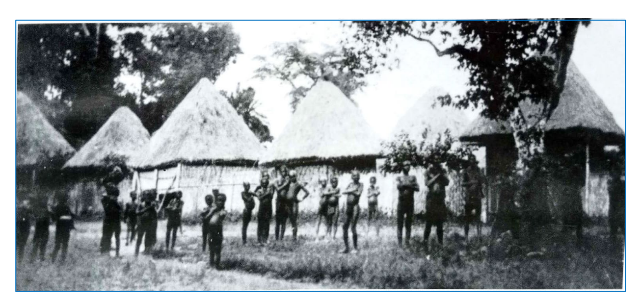
Source: The Bafut Tikars succeeded in establishing their hegemony over these people. It happened that

Source: Customs and Traditions of Bafut, p. 37.