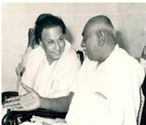
Dr.MGR – Karmaveerar Kamaraj Letter of Prime Minister Pandit Jawaharlal Nehru