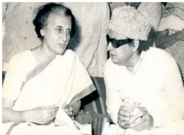
Dr.M.G.Ramachandran & Former Prime Minister of India Late Smt.Indira Gandhi

It is unfortunate that MGR fell ill on 6 th October 1984 and admitted in Apollo Hospital and on 16 th October 1984 Smt.Indira Gandhi who was the Prime Minister of India visited MGR at Apollo Hospital and made special arrangements to air life MGR to Brooklyn Hospital, USA.