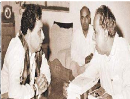
Dr. M.G.R with Perarinar Anna