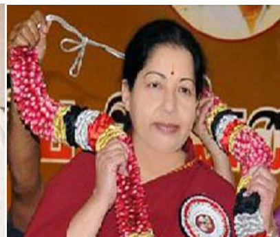
Selvi Dr. Jayaraman Jayalalitha

Let us move on to see the life history of Bharat Ratna Dr. Marudur Gopala Menon Ramachandran. How he emerged from an ordinary childhood actor of a drama troupe - to a mega-superstar, par excellence not only giving stellar performances in his movies but also responsible in disseminating socially, ethically, culturally relevant information through the movies including the evergreen and meaningful songs.