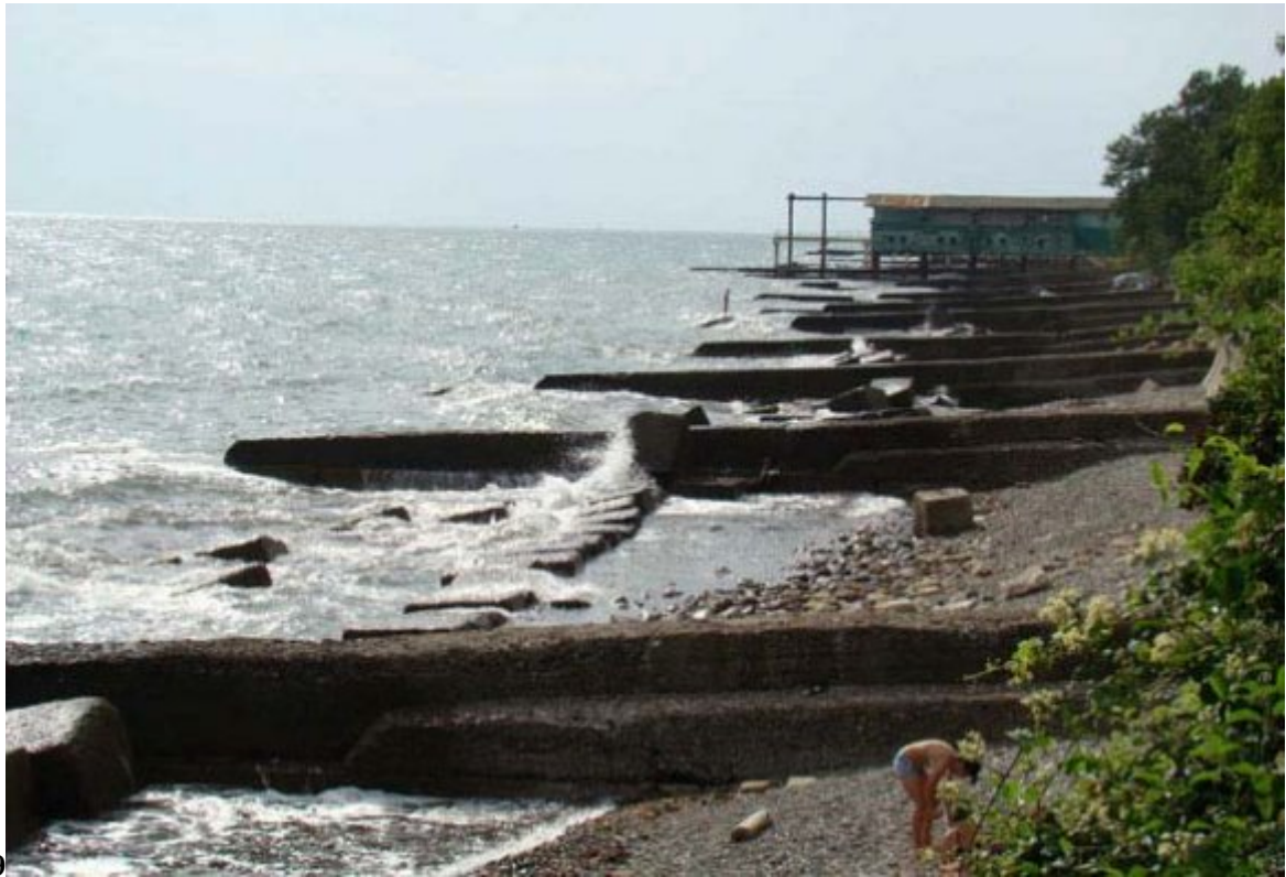
Figure 11: Fig. 9 :