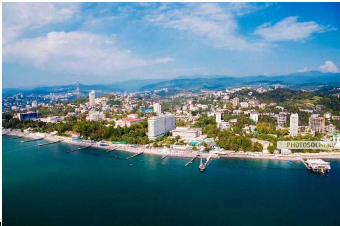
Figure 3: Fig. 4 :