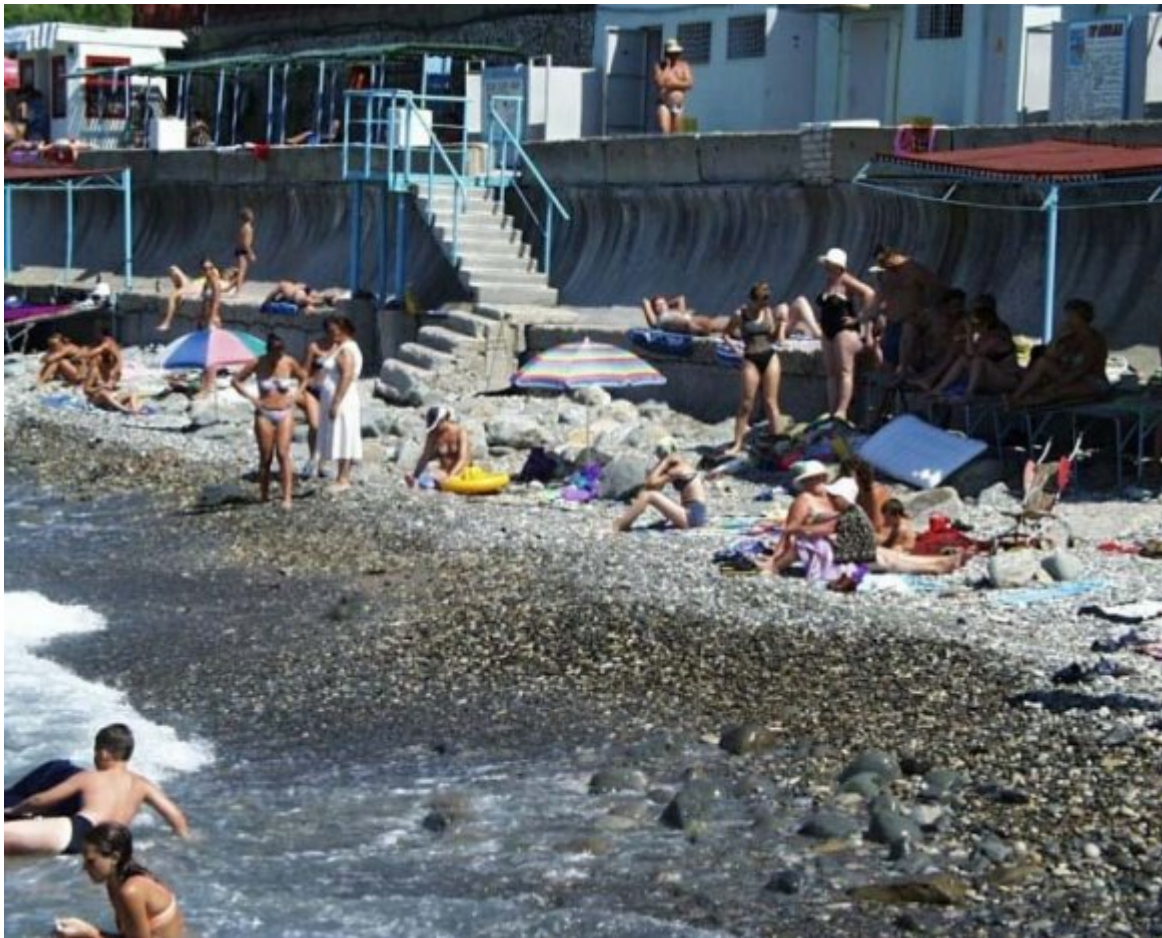
Figure 14: Coastal