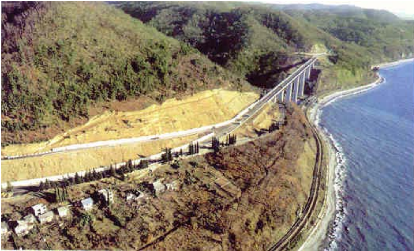
Figure 4: Coastal